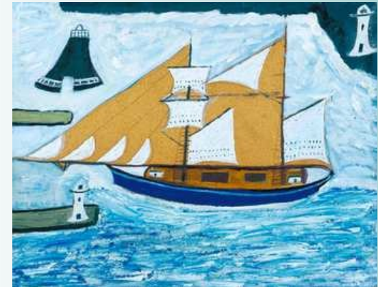
Alfred Wallace 1823-1913

To improve mastery of art and design techniques, in the context of printing, weaving with plastic, drawing, making lanterns.